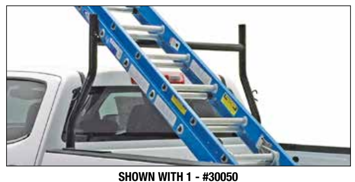
SHOWN WITH 1 - #30050