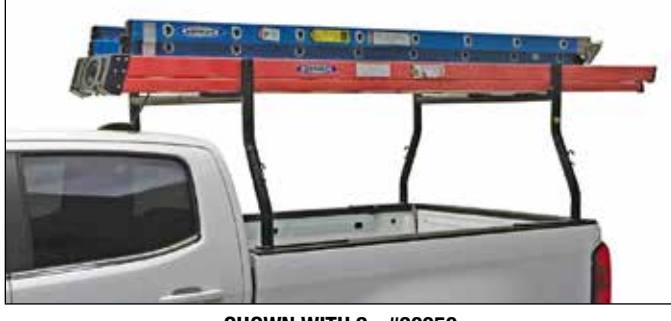
SHOWN WITH 2 - #30050