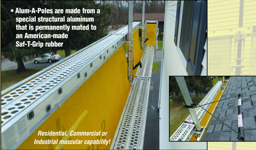
Residential, Commercial or Industrial muscular capability!